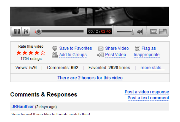
Figure 1: Youtube.com rating and sharing interface

Digg.com [5], another popular community site, focuses on simple "thumbs-up" or "thumbs-down" ratings for sites, but also shows the quantity of discussion (comments) and the proposed category of the Web page being rated. The interface is simple and the number of possible actions (for registered users) is kept to a minimum to enable easy, multiple ratings during a visit to the site.