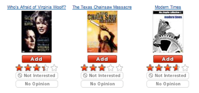
Figure 4: Netflix movie rating display with thumbnails and interactive buttons.

Netflix.com [7] shows some of the same movie-related information, such as the title of the movie, but simplifies the interaction to include a graphic of the movie poster a simple 5-star rating interface. Tool tips are used when the cursor hovers over each star to show what the star rating means (e.g. "Hated It").